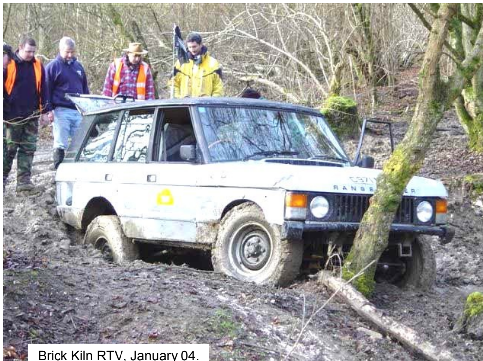
Brick Kiln RTV, January 04.