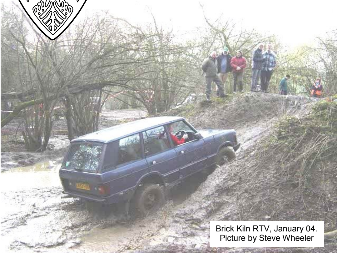
Brick Kiln RTV, January 04.